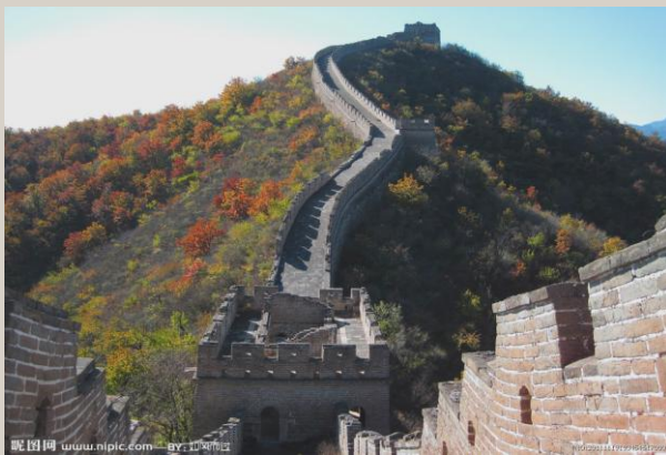
The Great Wall