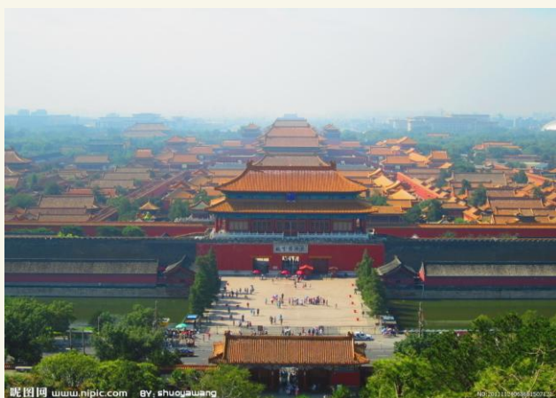
The Forbidden City