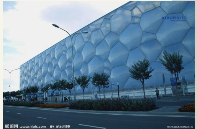
The Water Cube