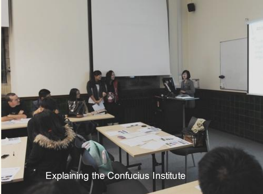
Explaining the Confucius Institute