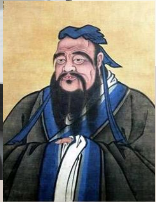
Confucius (551 BC – 479BC)

The Confucius Institute is a non-profit institute, which aims at promoting the spread of Chinese language and culture and encouraging cultural exchanges. It is generally based at educational institutions such as foreign universities and research institutions. The Confucius Institute at Bangor is jointly funded and was set up by Bangor University and China University of Political Science and Law (CUPL)