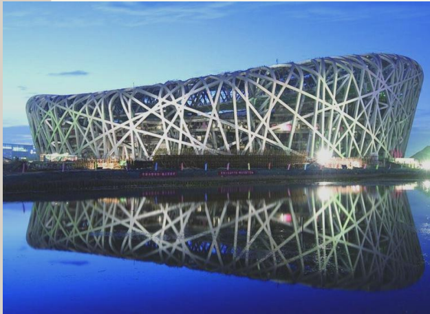
The Bird's Nest

AT BANGOR UNIVERSITY NEWS LETTER 6 - OCTOBER 2012