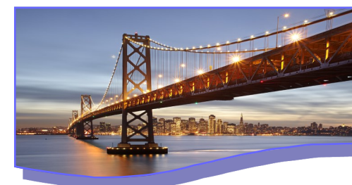
City of San Francisco: San Francisco-Oakland Bay Bridge