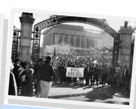
Learn about Berkeley