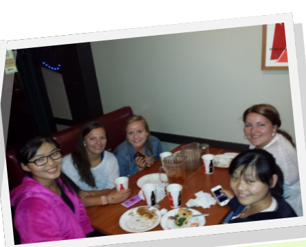
Make New Friends