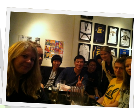
Experience New Cultures