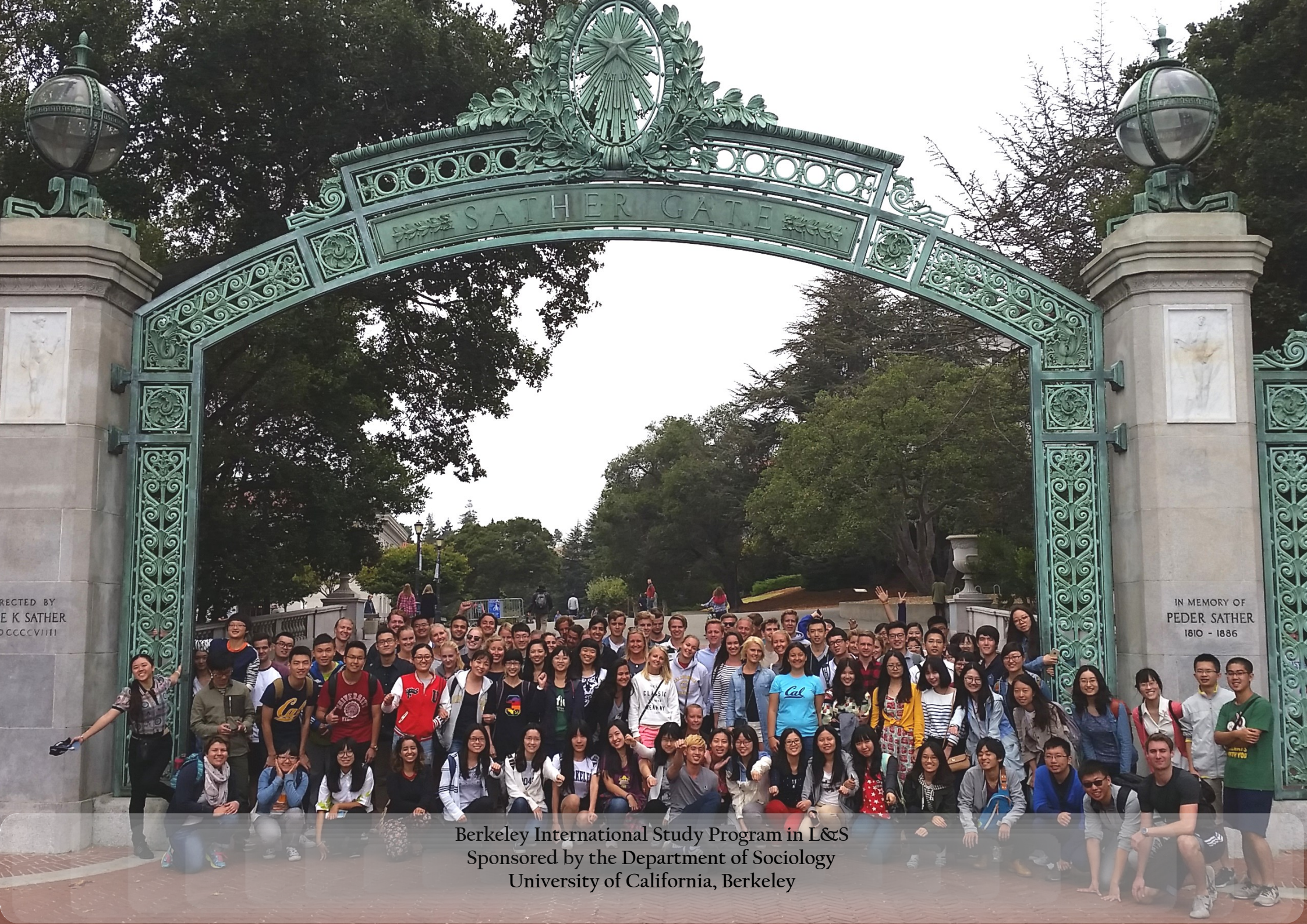
Berkeley International Study Program in L&S Sponsored by the Department of Sociology University of California, Berkeley