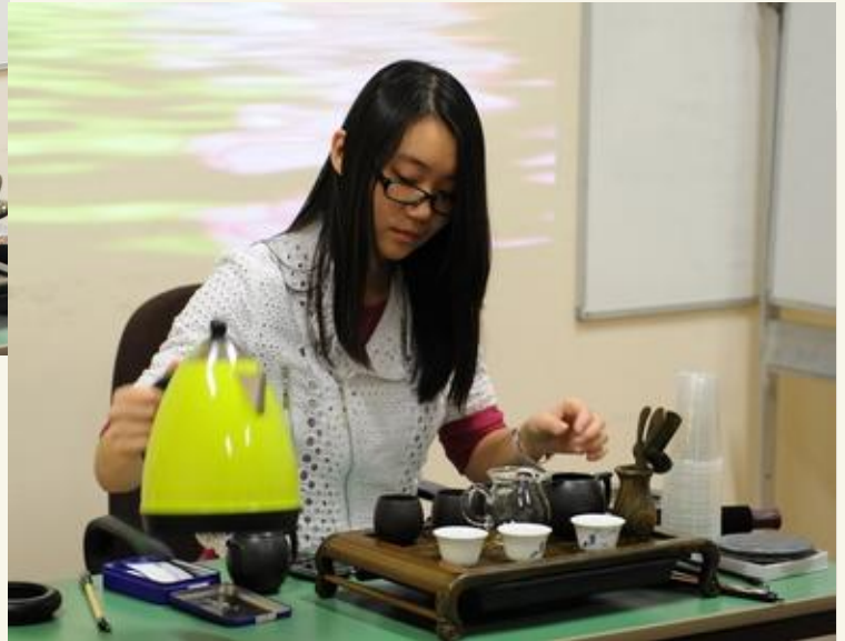
A Chinese volunteer

According to scientific studies, tea contains more than 600 chemical ingredients. Some of them are nutrients necessary for human body, e.g. vitamins, proteins, amino acids and so on.