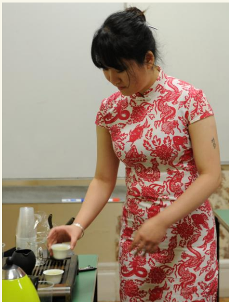
Tea served by some Chinese volunteers dressing in traditional style