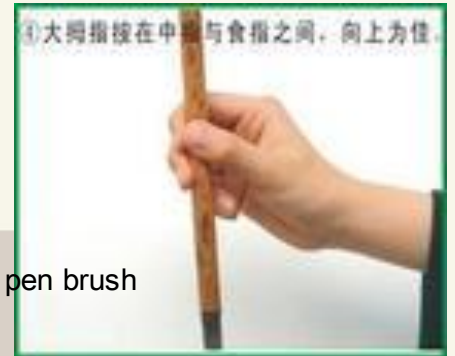
How to hold a pen brush