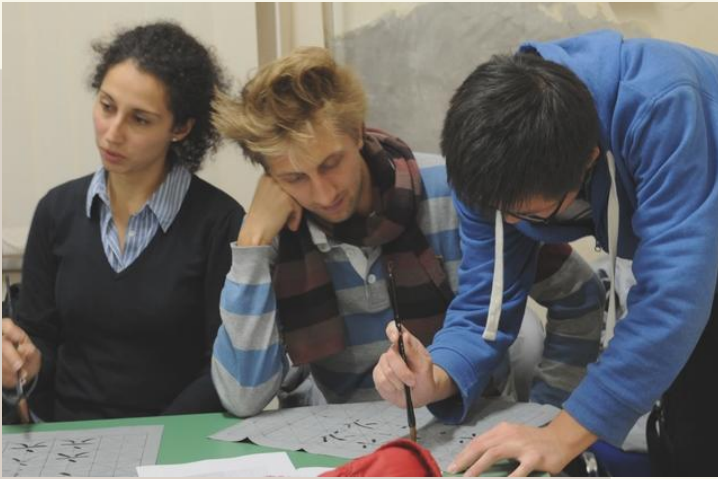
The class was helped by some Chinese volunteers